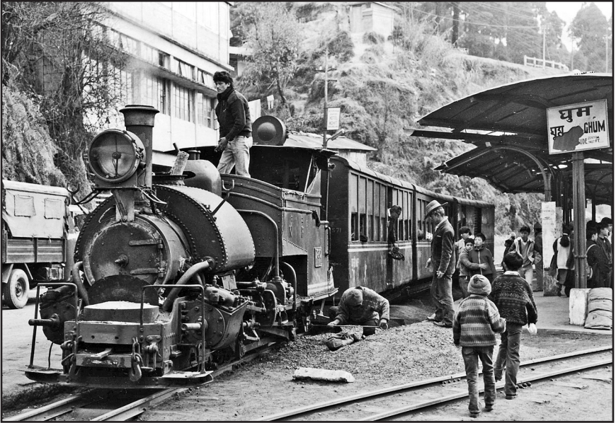
Darjeeling Himalayan Railway's 780 at Ghoom, India, on March 8, 1995.