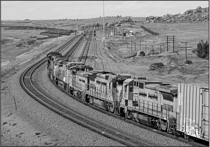
A westbound freight on October 13, 2013, with three older units on the head end that were ready for auction, having the road name already blacked out.