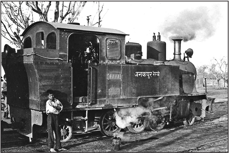
Janakpur Railway's "Rama" at Janakpurdham, Nepal, on March 8, 1995.