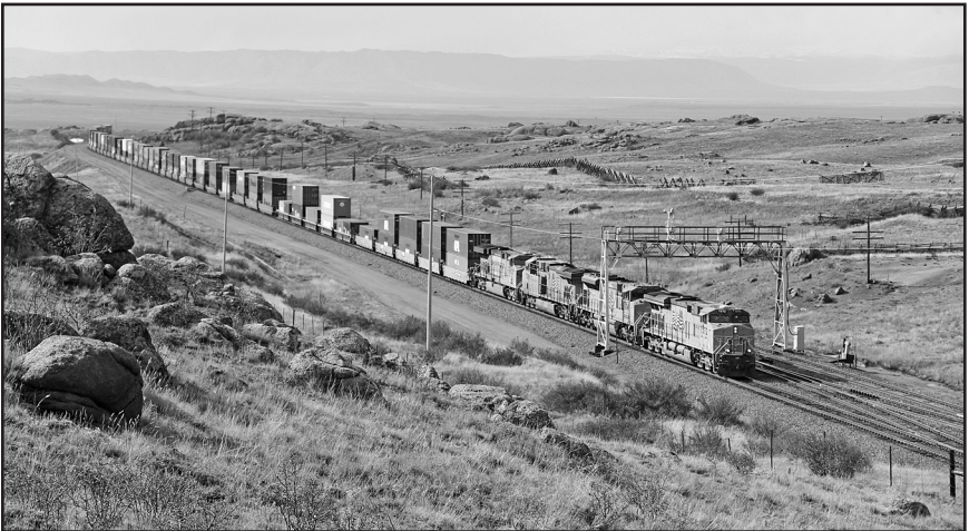
U.P. 7372 climbs eastbound with a container train, just about to enter the Hermosa tunnel on October 13, 2013.

Note: The Dale Junction photo locations are west of the famed Sherman Hill. The photo group was allowed on private land with the express permission of the ranch owners.